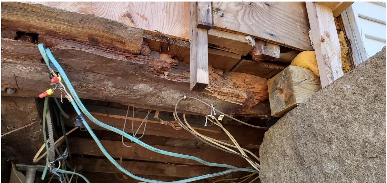
Rear right sill