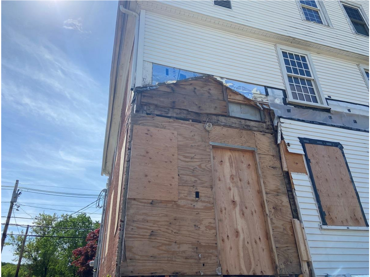
Second floor corner