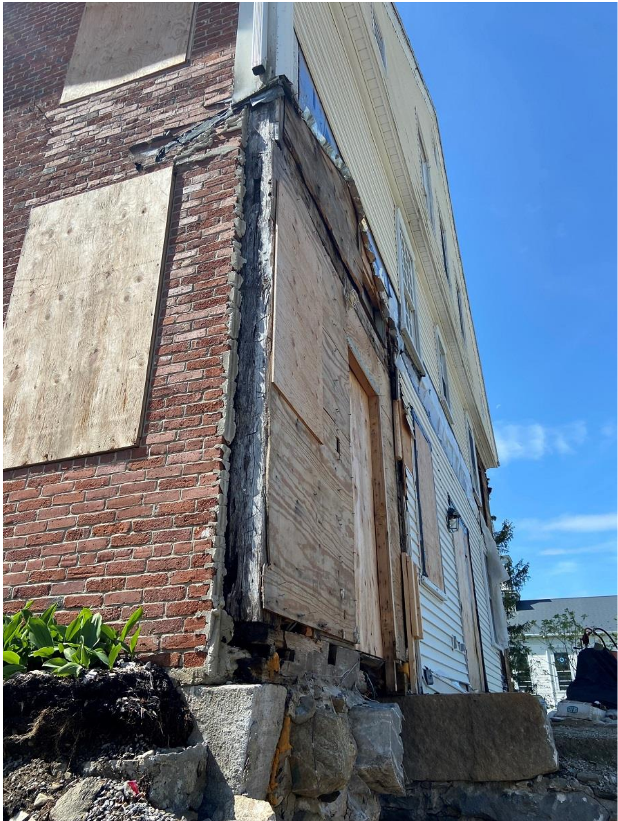
Rear right corner