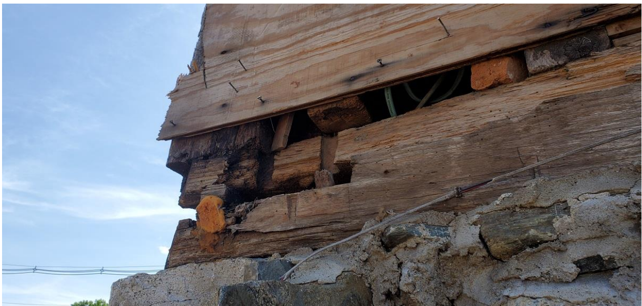
Right rear sill