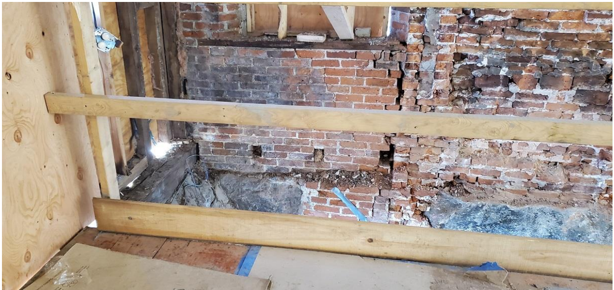
Brick at right rear