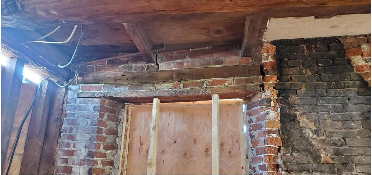
Brick at first floor ceiling