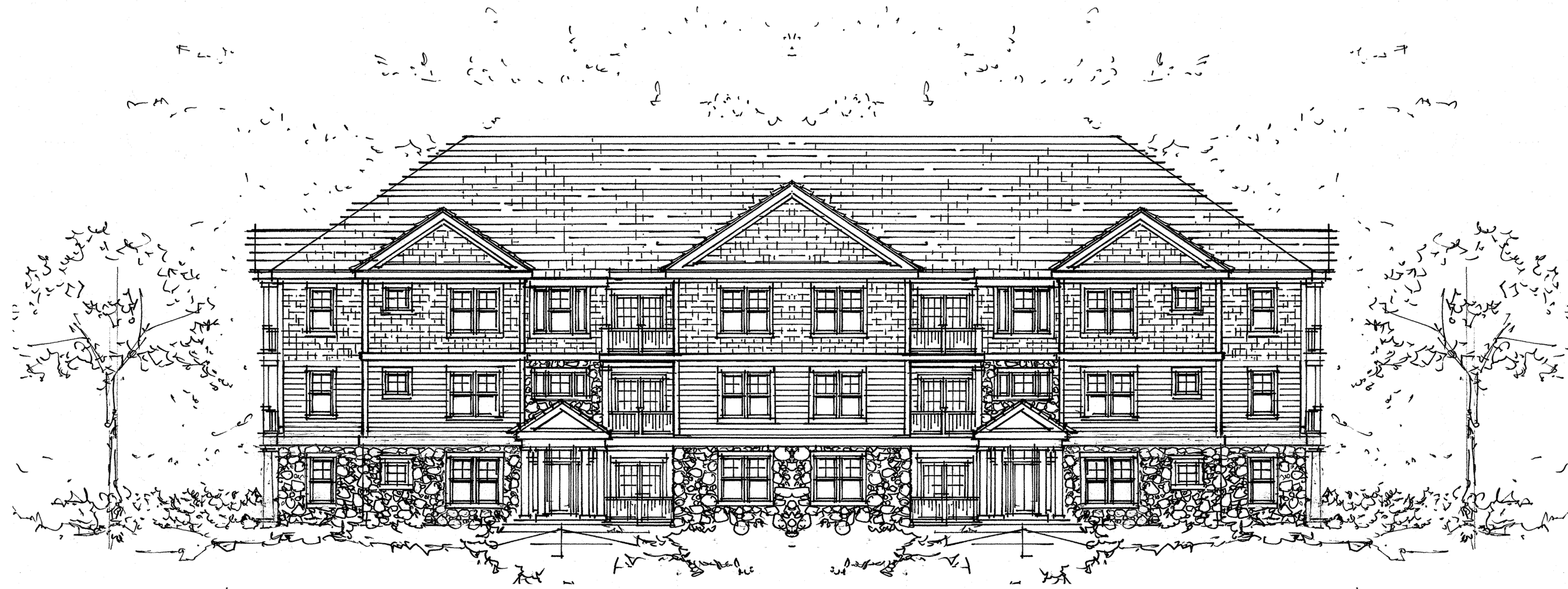
TYPICAL FRONT ELEVATION 24 AND 28 UNIT BLDG