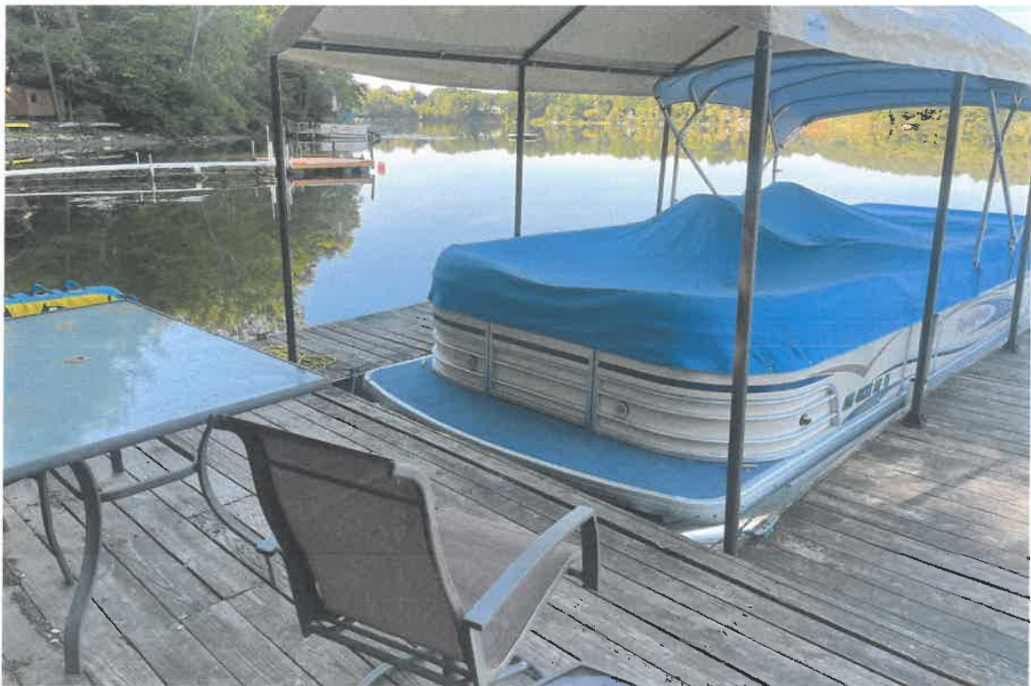
'20 x'14 PATIO PLATFORM (SEASONAL AND REMOVABLE) MADE WITH PT LUMBER